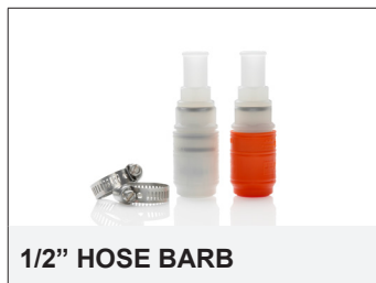
1/2" HOSE BARB

*KIT-QSV FKM O-RINGS *KIT-QSE EP O-RINGS