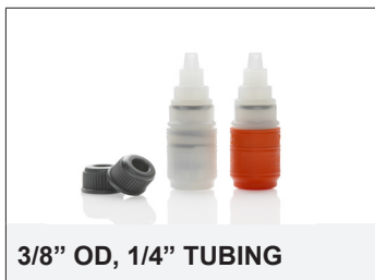
3/8" OD, 1/4" TUBING

*KIT-QSV FKM O-RINGS *KIT-QSE EP O-RINGS