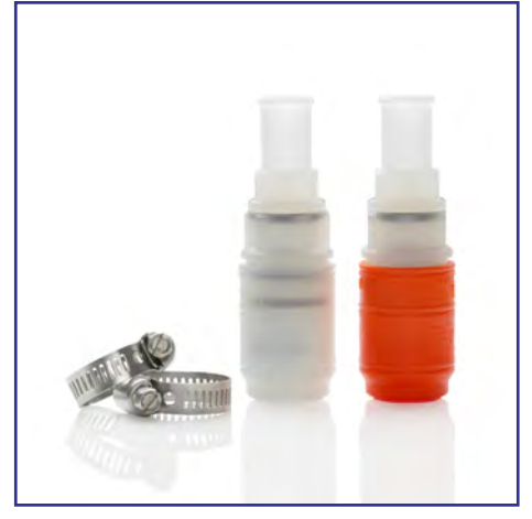
1/2" Hose Barb