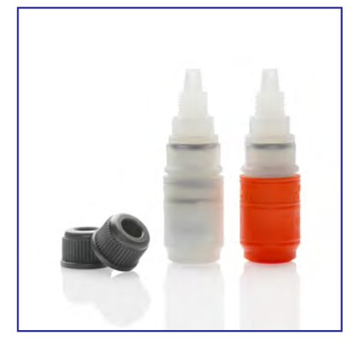
3/8" OD x 1/4" Tubing